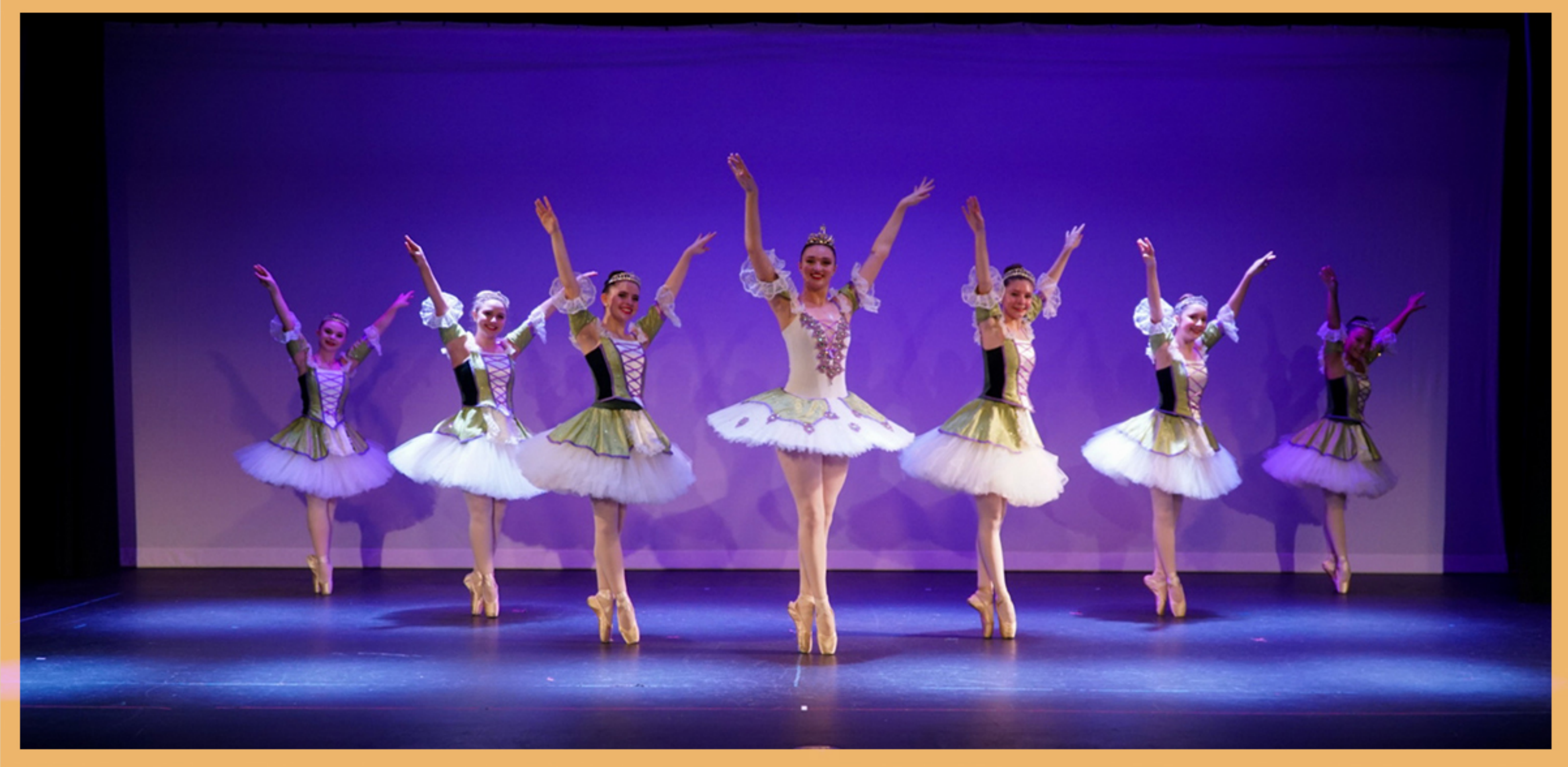
French Petit Fours